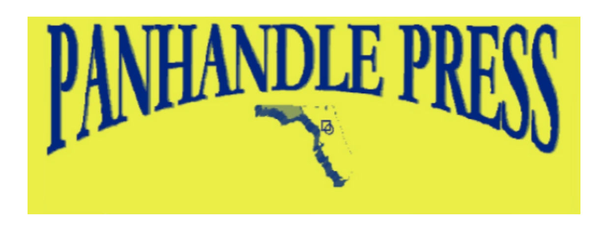
Volume 49, Number 2 April, May and June 2024